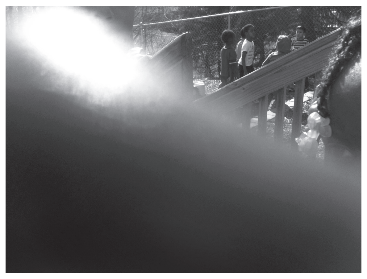
Figure 5 Children cluster during play throughout the afternoon. They move about quickly among groups of friends, play equipment, and toys.