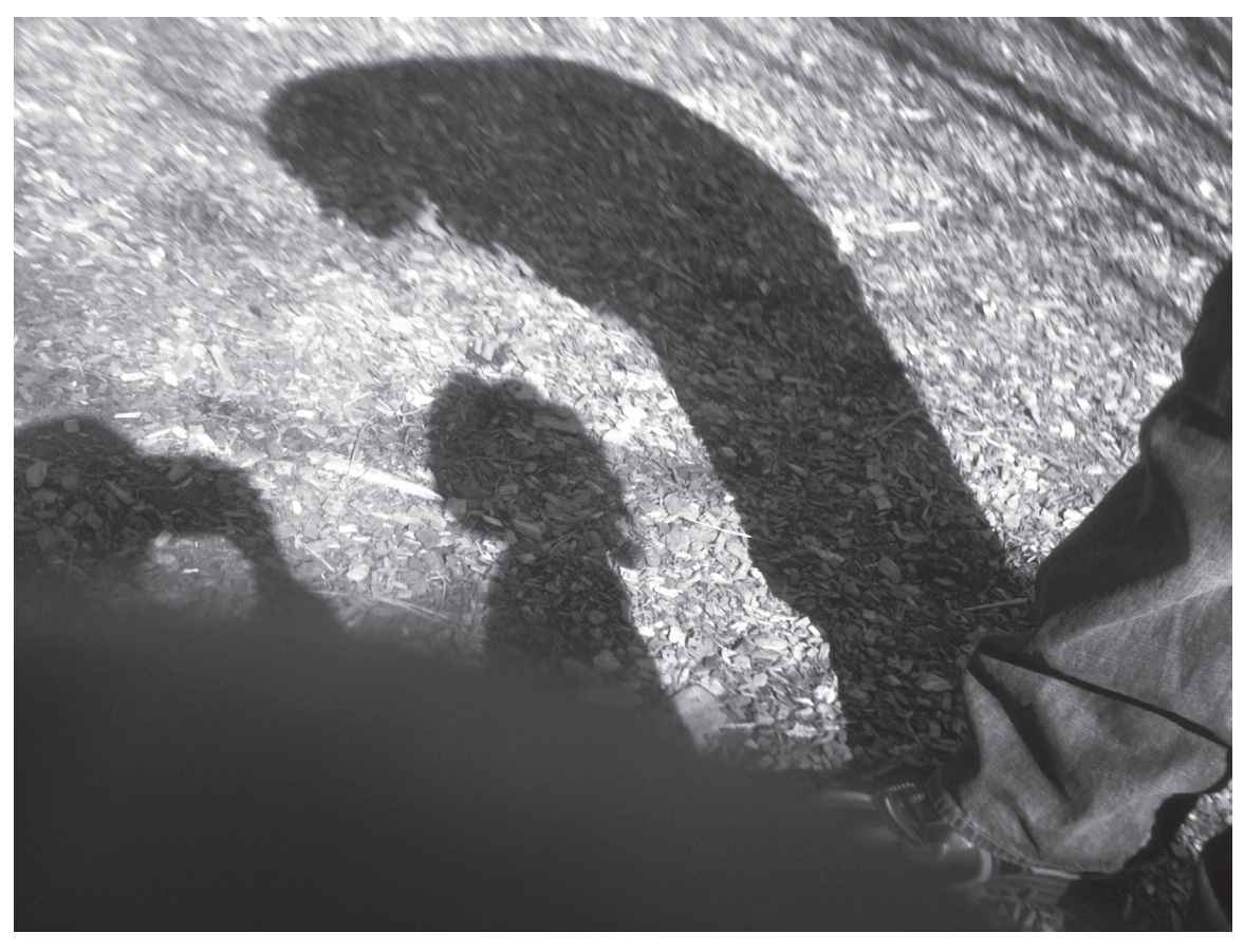
Figure 6 Shadows stretch across the playground as preschoolers learn how to use the camera.