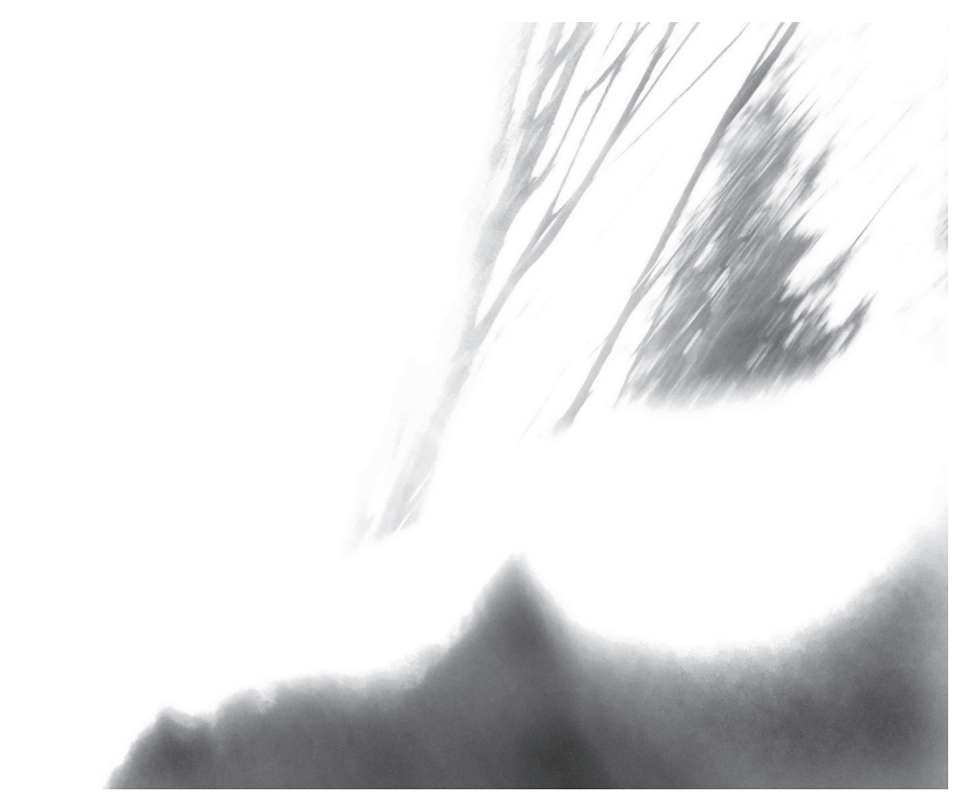
Figure 4 Light pushes through the trees behind the neighborhood center. Such a bright image counters many of the published tales from the neighborhood that show the space as being dark and desolate.